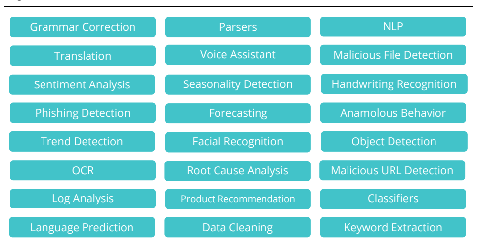
Figure 1: Breadth of AI Work at Zoho

Zoho has actually been working on a variety of use cases for AI for 10 years and it has indeed insinuated itself throughout the apps (Figure 1).